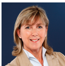
Lydie Polfer Mayor